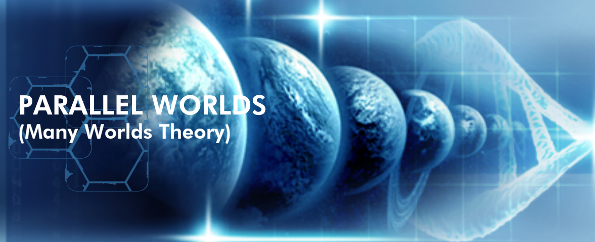
PARALLEL WORLDS (Many Worlds Theory)