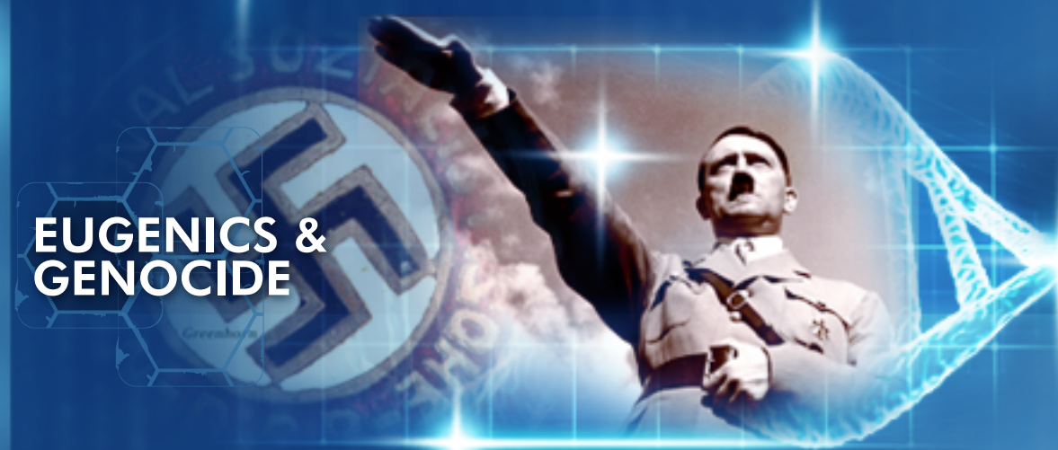
EUGENICS & GENOCIDE