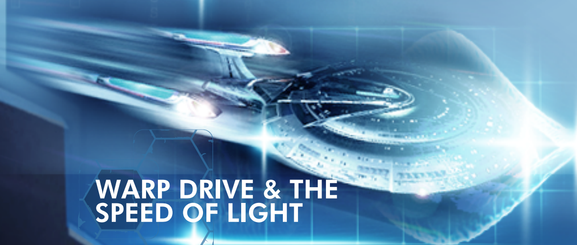
WARP DRIVE & THE SPEED OF LIGHT