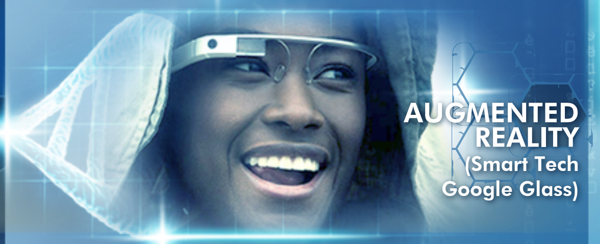
AUGMENTED REALITY (Smart Tech Google Glass)