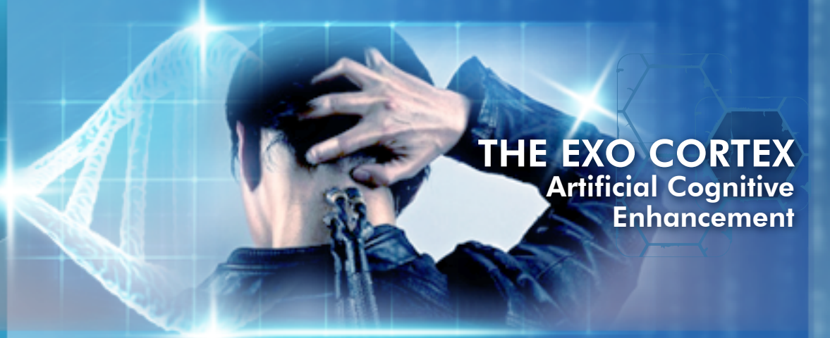
THE EXO CORTEX Artificial Cognitive Enhancement