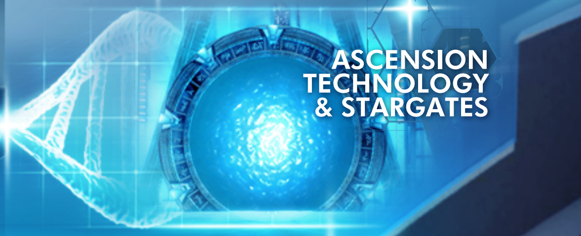
ASCENSION TECHNOLOGY & STARGATES