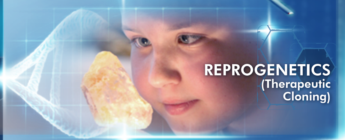
REPROGENETICS (Therapeutic Cloning)