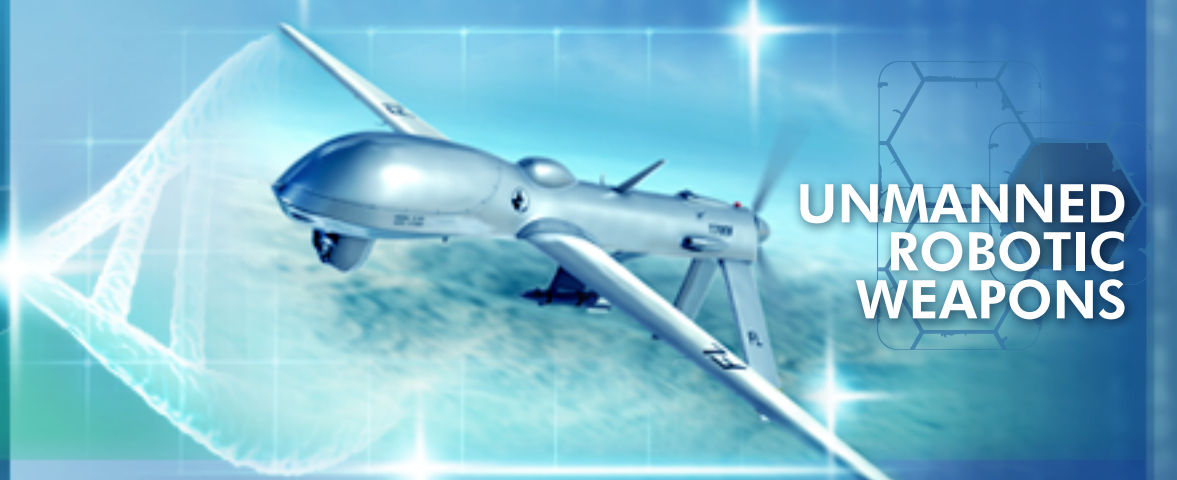
UNMANNED ROBOTIC WEAPONS